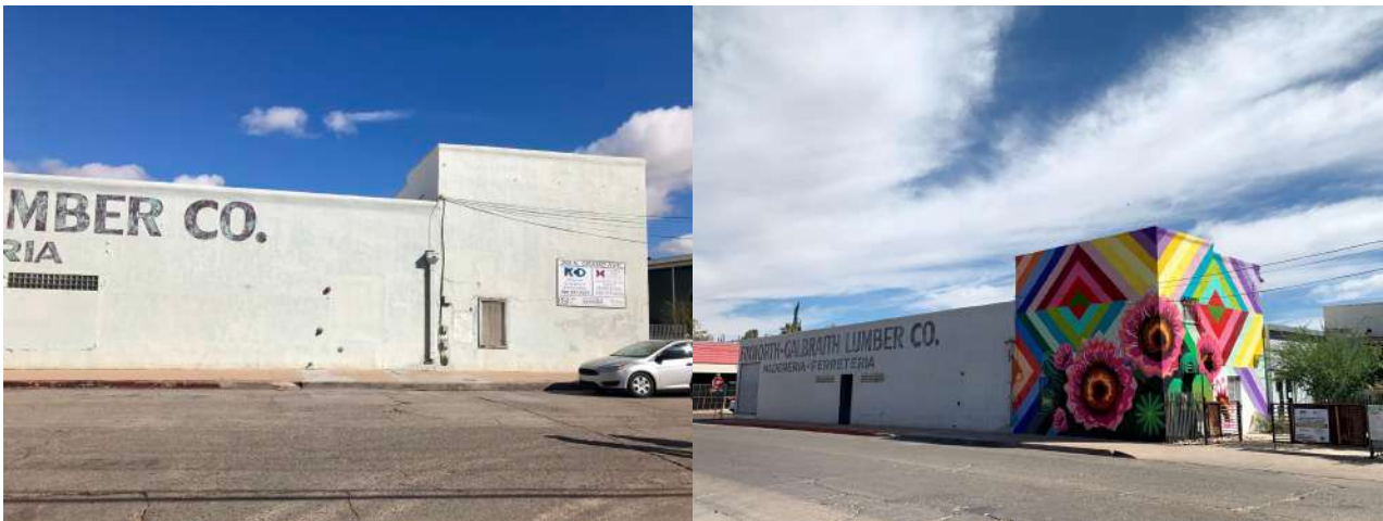
(Left) Nogales Community Development before artistic improvement